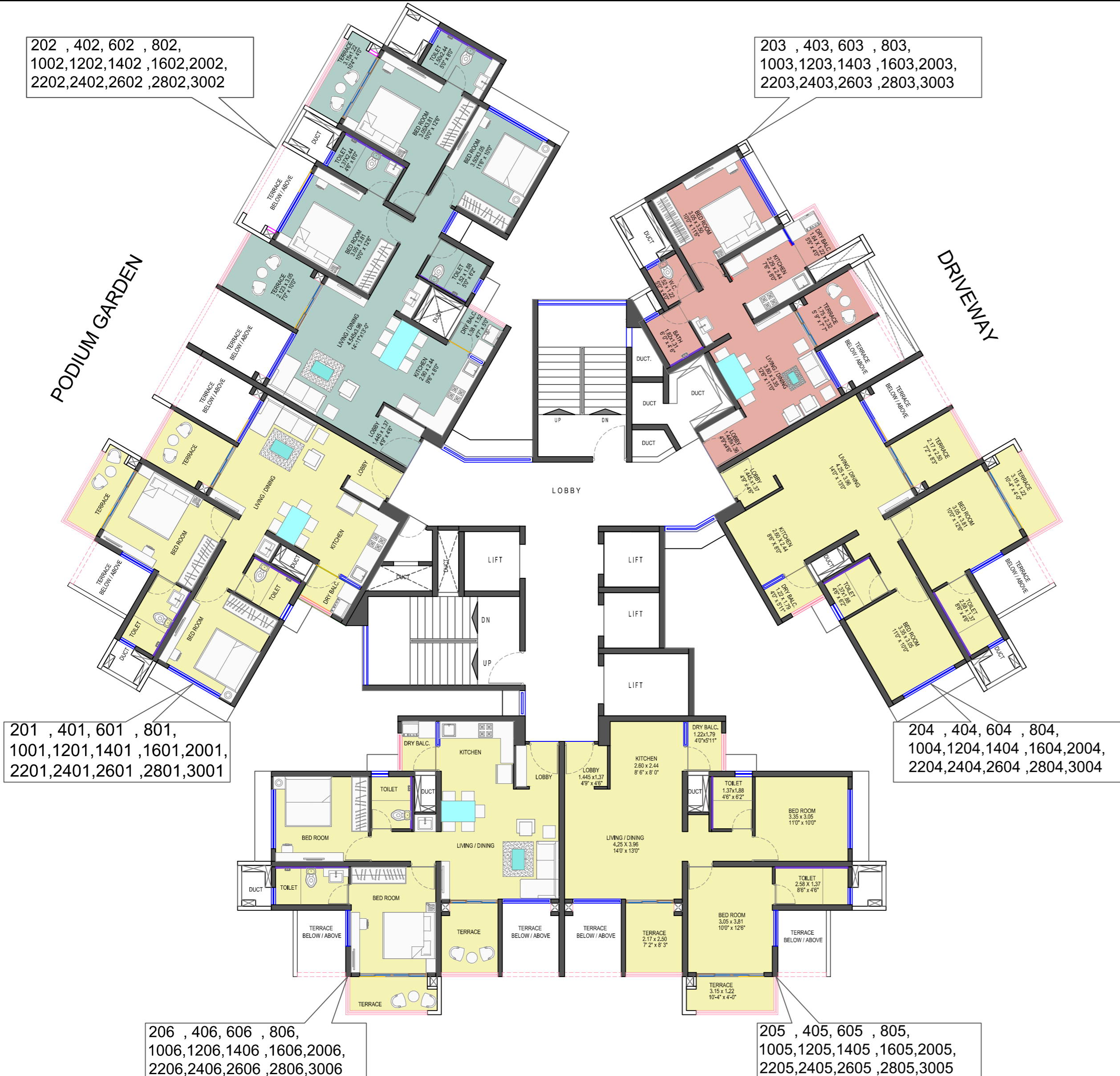
Wing A 2nd TO 30th EVEN FLOOR PLAN