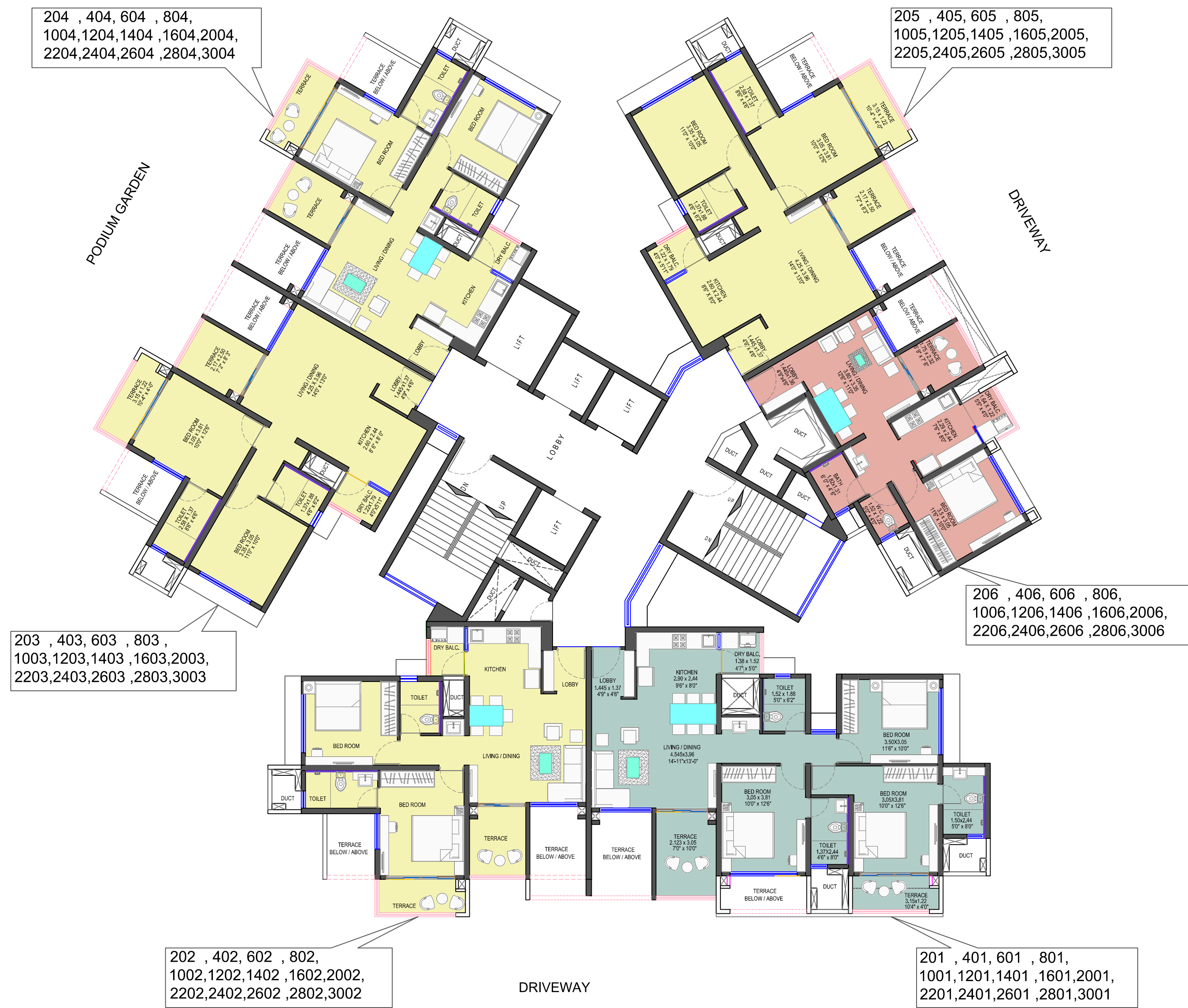
Wing D 2nd TO 30th EVEN FLOOR PLAN